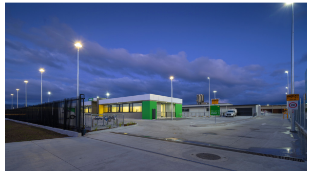
Boral Carpark at Night