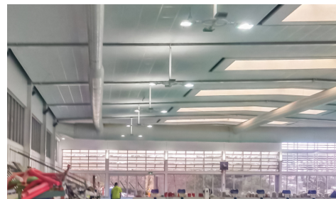
Launceston Aquatic Centre 4