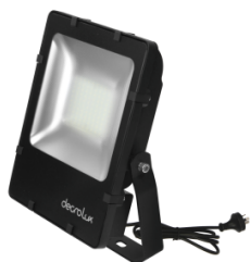
RHYNE 200W Industrial Grade Floodlight