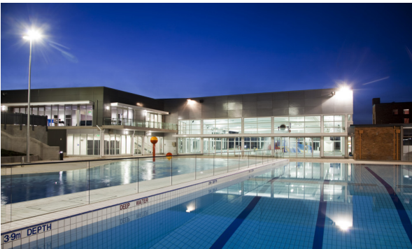
Decrolux Launceston Leisure And Aquatic Centre