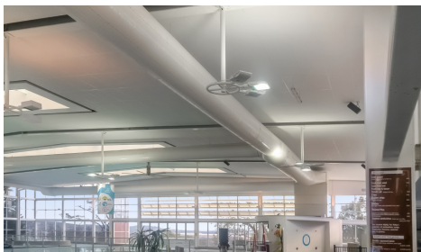
Launceston Aquatic Centre 3