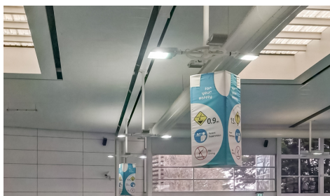
Launceston Aquatic Centre 5