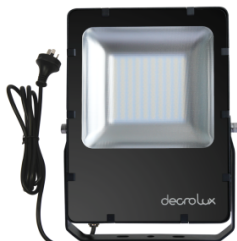
RHYNE 72W Industrial Floodlight