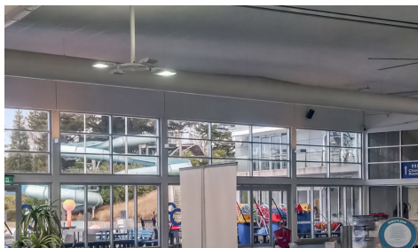
Launceston Aquatic Centre 1