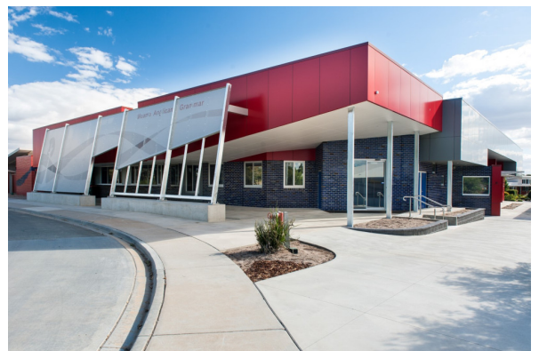
Moama Anglican Grammar School