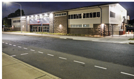
Afl Pavilion Canberra 18