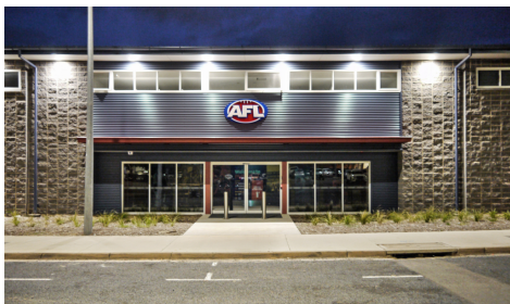
Afl Pavilion Canberra 11