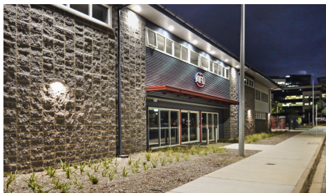
Afl Pavilion Canberra 9