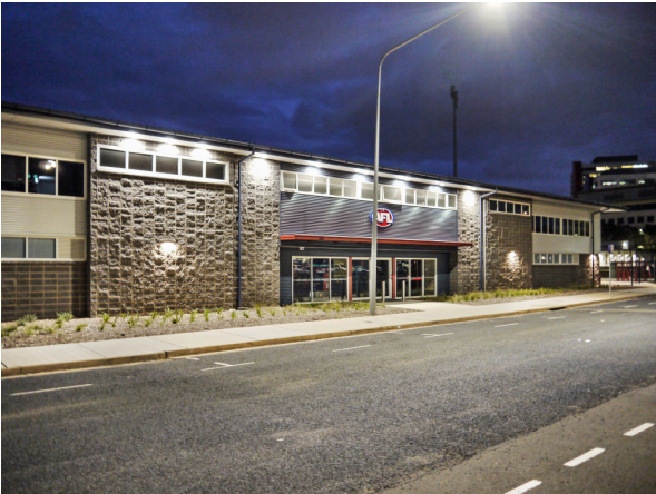
Afl Pavilion Canberra 3