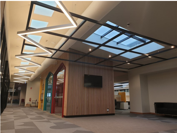
St Pat's Lobby