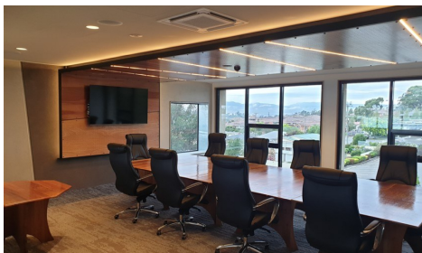
St Pat's VC Room