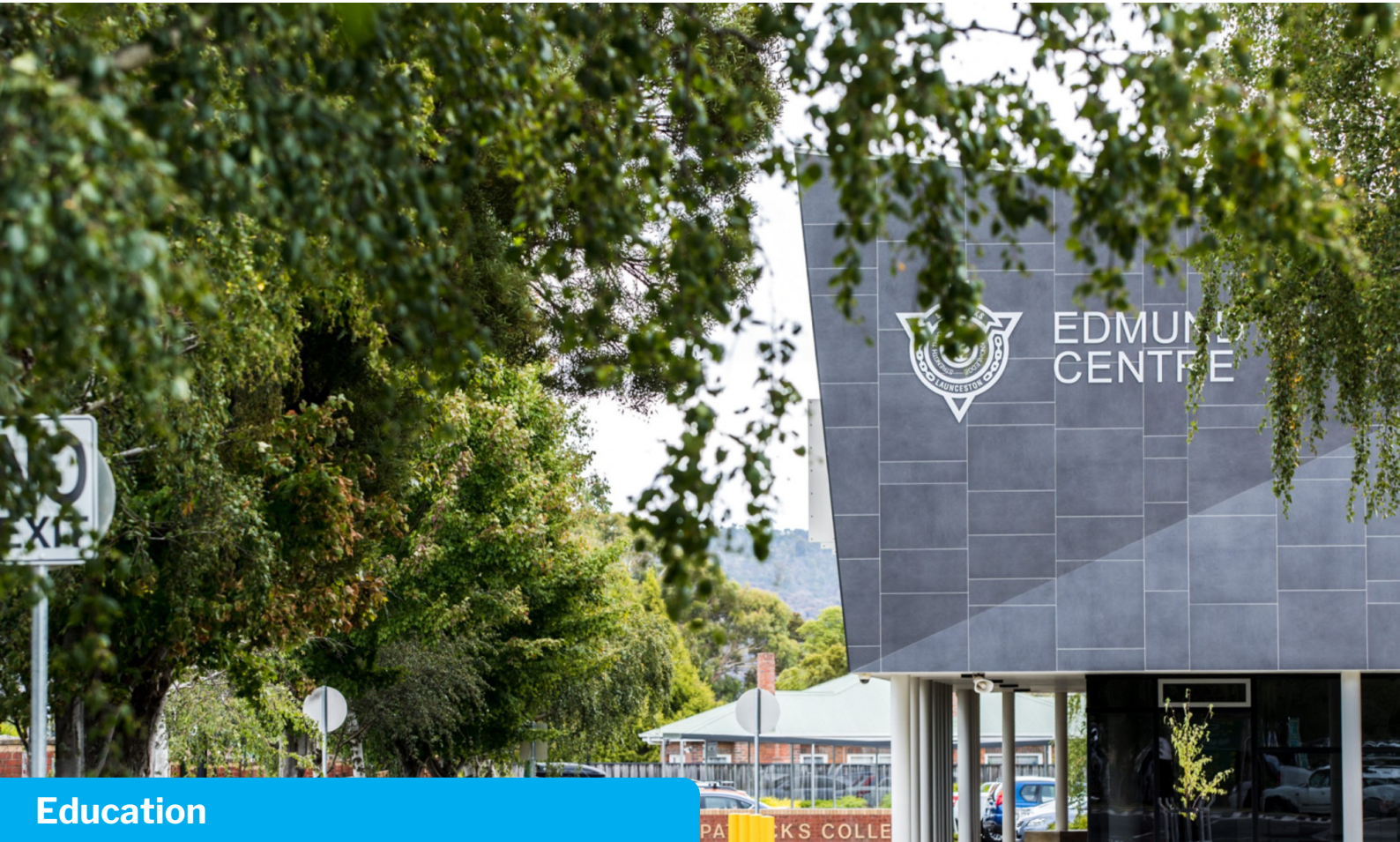
St Pat's Exterior

Staff & Administration Redevelopment + Brady Wing