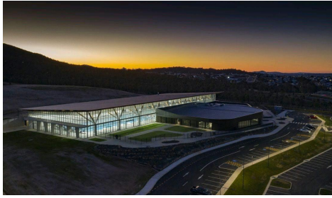
Stromlo at Night