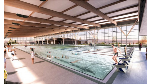
Stromlo Leisure Centre