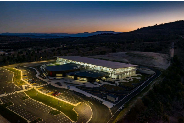
Stromlo at Night