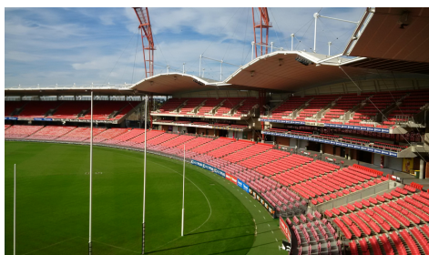
Spotless Stadium Sydney Olympic Park Sydney Showgrounds 28